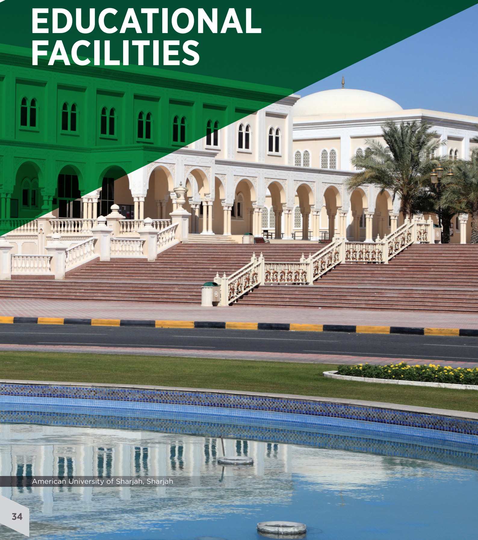
American University of Sharjah, Sharjah