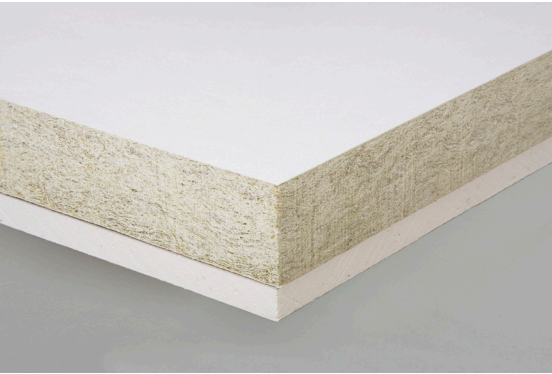
50 mm (NRC 0.95)