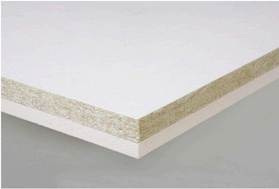
38 mm (NRC 0.75)