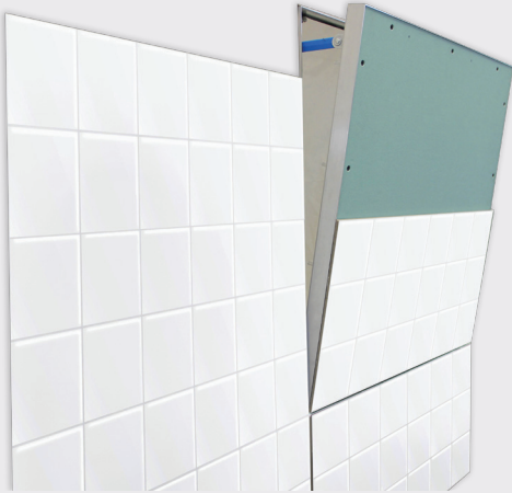
INSTALLATION AND FIXING